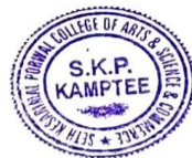
Principal Seth Kesarimal Porwal College of Arts & Science & Commerce, Kamptee